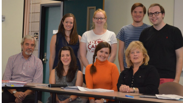
Participants in the Joint MA "Interdisciplinary Methods" Seminar that meets alternate weeks at UB and Brock. October 2013

Brock University was founded in 1964 and currently enrolls 18,500 students on its Niagara Escarpment campus in St. Catharines, ON. Long a world leader in the field of Canadian Studies, the interdisciplinary Program is a unit within Brock's Faculty of Humanities.